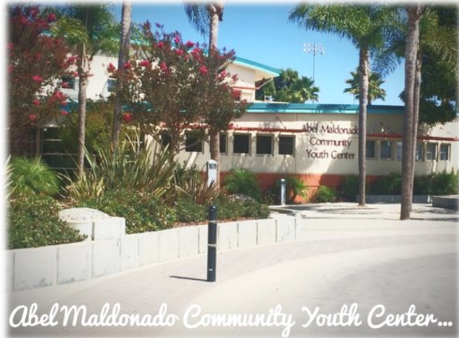
Abel Maldonado Community Youth Center...

Whether or not your social calendar is full this month, there is always something fun happening at the Mussell Senior Center and at our other state-of-the-art recreational facilities. Did you know seniors age 65 or older can use the fitness center and swimming pool located at the Maldonado Youth Center and Paul Nelson Aquatic Center at no charge? All you need to do is obtain your free ID card from the front desk in the Youth Center lobby located at 600 South McClelland Street. During the summer, seniors can enjoy the 50-meter swimming pool literally morning, noon, and night! Early risers can swim from 5:30-7:00 a.m.